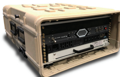
RORO transit case with iDirectGov 9800 AR