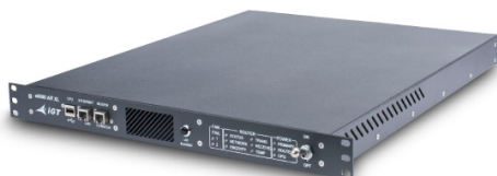
e8000 AR XL

The FIPS version of our most powerful router features tamper evident seals.